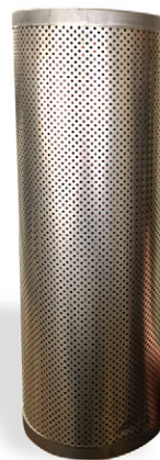
Swarf Monster oil cartridge filter