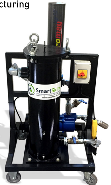
Swarf Monster view from back

Universal Separators, Inc. 608-442-7546 support@smartskim.com www.smartskim.com