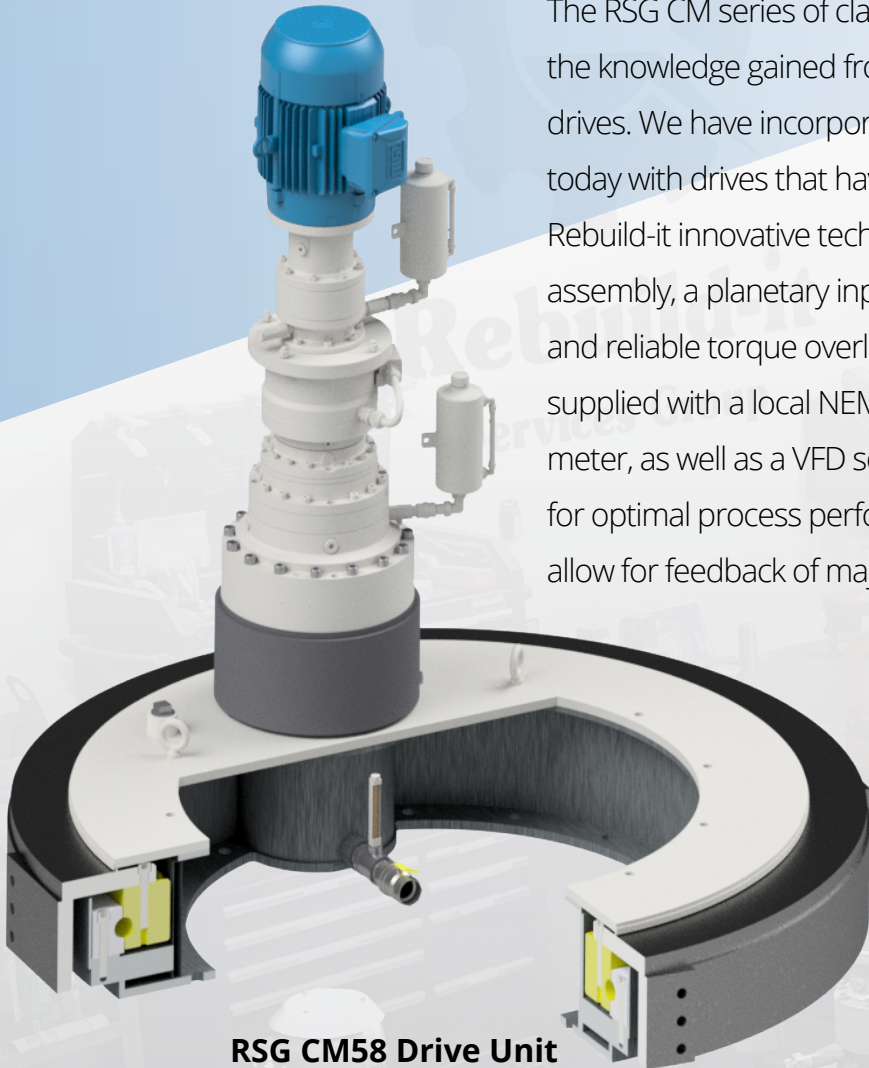
RSG CM58 Drive Unit

The RSG CM series of clarifier and thickener drives have been designed with the knowledge gained from years of experience in rebuilding manufacturer's drives. We have incorporated proven reliability features that are still present today with drives that have been in service for 30 plus years along with Rebuild-it innovative technology. The CM series drive has an upgraded gear assembly, a planetary input reducer with integral loadcell providing optimal and reliable torque overload protection. All RSG CM series of drives are supplied with a local NEMA 4X control panel containing the torque display meter, as well as a VFD so that the clarifier or thickener speed can be adjusted for optimal process performance. The CM drive panel has been designed to allow for feedback of major functions to the plants SCADA system.