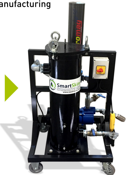
Swarf Monster view from back

Universal Separators, Inc. 608-845-2167 support@smartskim.com www.smartskim.com