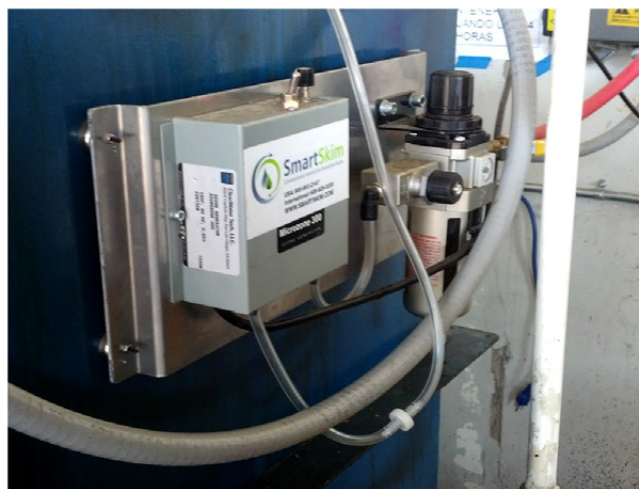
Ozone Generator retrofitted to central coolant system