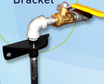
Valve & Bracket

As the ozone gas is dispersed through the fluid, the ozone instantly kills all forms of bacteria, fungus, yeast and mold on contact and then reverts to its original form: oxygen. The ozone generated does not alter the fluid in any way and does not harm the operators.