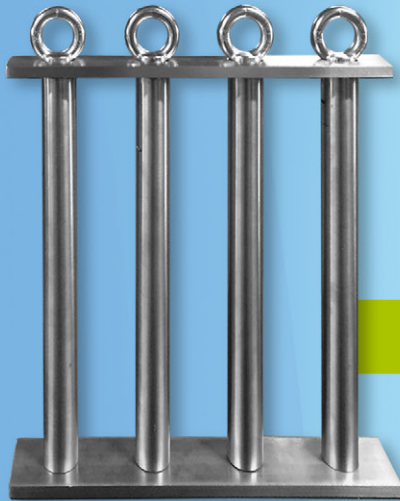
MagGrid with Sleeves

Grids are available in several different arrangements.