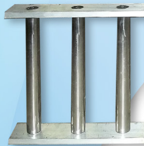
MagGrid without Sleeves

Rare Earth Magnetic Rods and Grids are available in many different arrangements and sizes.